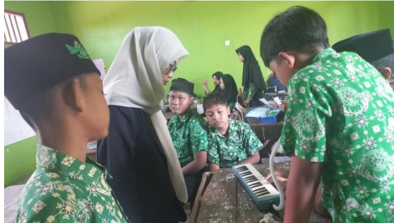
Figure 2. Playing the Piano Instrument